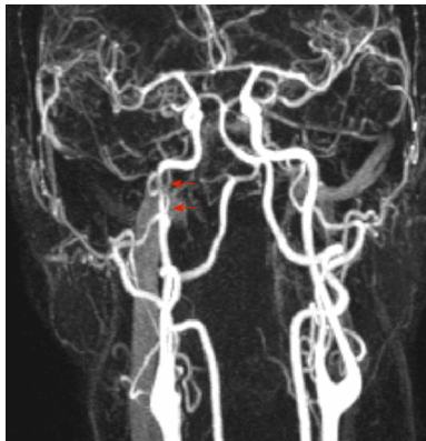
Figure 2 Time of flight MR angiography showing stenosis (arrows) of the extracranial internal carotid artery up to the petrous segment.